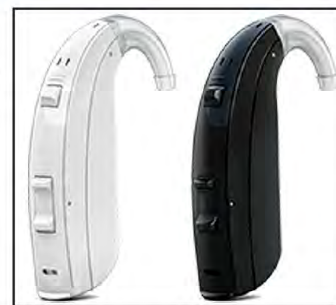
ReSound ENZO 2 Hearing Aids